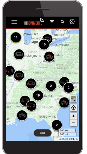
Prevent unexpected downtime due to unsafe operations.