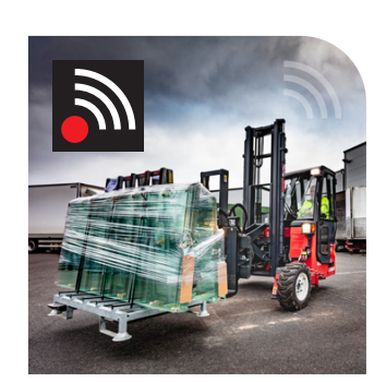
Be able to trace your equipment in real time.