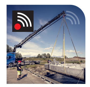
Prevent accidents caused by improper use of equipment.