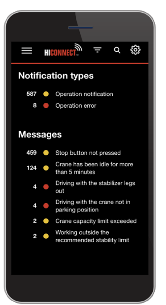
Boost operator efficiency and prevent equipment misuse.