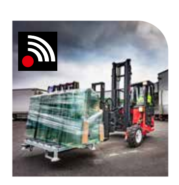
Get information on every delivery made and idle time per visit