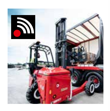
Get an alert on any equipment misuse, so that you can act.