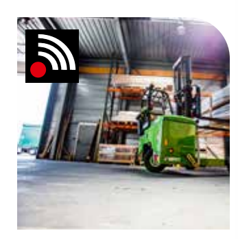
Keep track of upcoming preventive maintenance needs based on equipment usage.