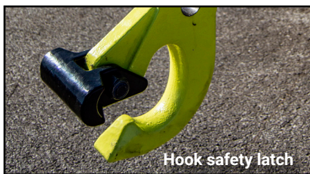
Hook safety latch

The MULTILIFT hook safety latch ensures that the bale bar is secured at all times.