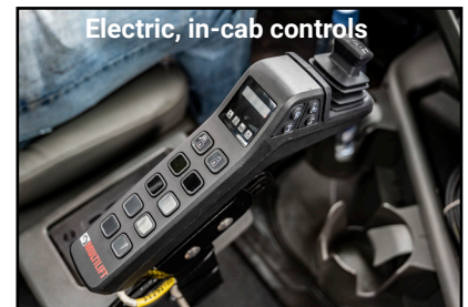
Electric, in-cab controls

MULTILIFT XR series incorporates a dual pivot design which offers smoother loading and unloading, as well as true dumping capabilities.