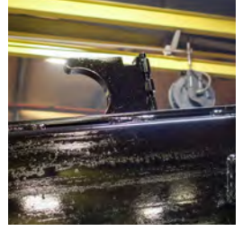
Auxillary fold down stops