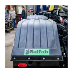
Poly, Steel & Aluminum Fenders