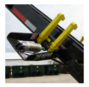
"The Hooker" Container Securement System