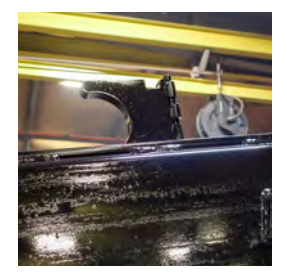
Auxillary fold down stops