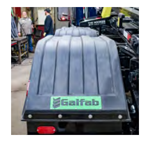
Poly, Steel & Aluminum Fenders