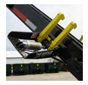
"The Hooker" Container Securement System